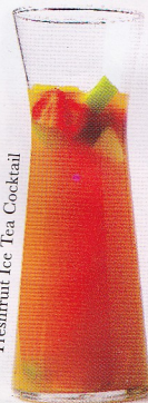
Freshfruit Ice Tea Cocktail

mango extract mixed with orange and tea. Inside it, you will find dices of fresh kiwis, strawberries, and apples. Another must taste menu is Grilled Baby Potato that makes your tongue begging for more.