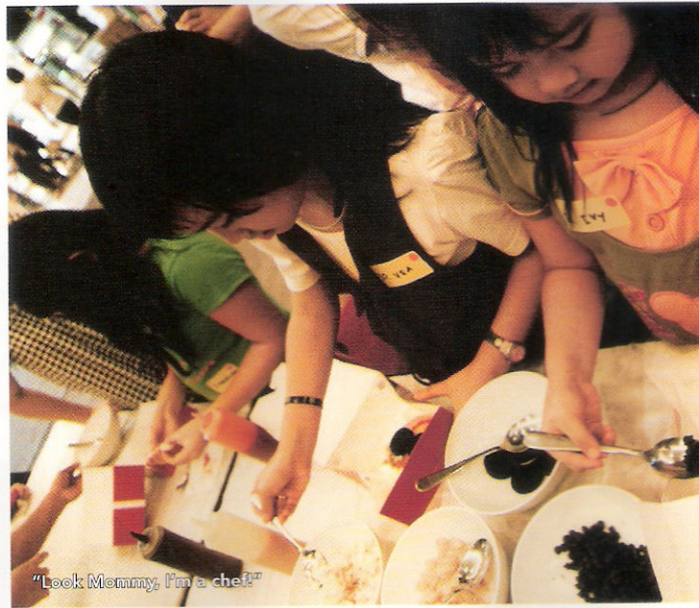
"Look Mommy, I'm a chef!"