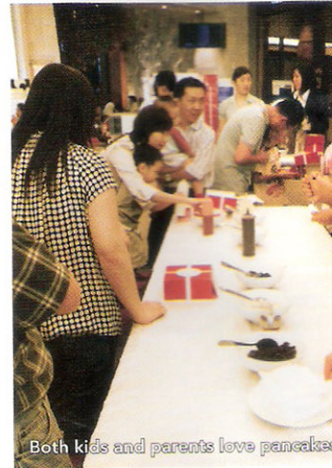
Both kids and parents love pancakes