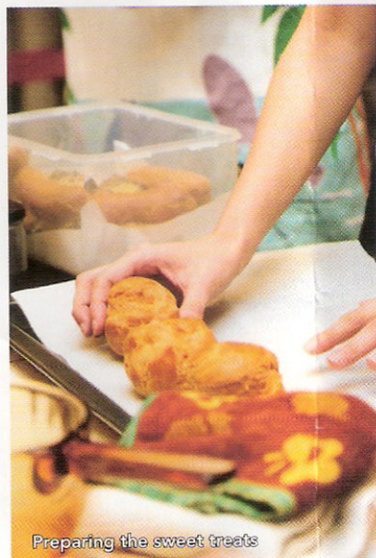
Preparing the sweet treats