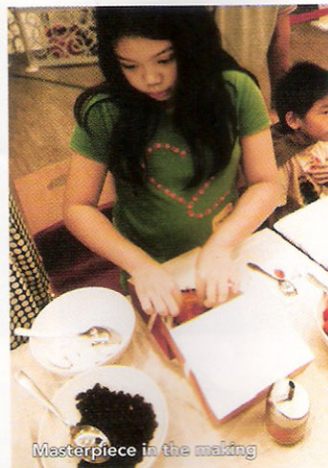
Masterpiece in the making